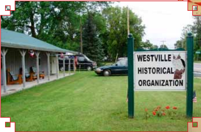
Our new sign in front of the history museum.