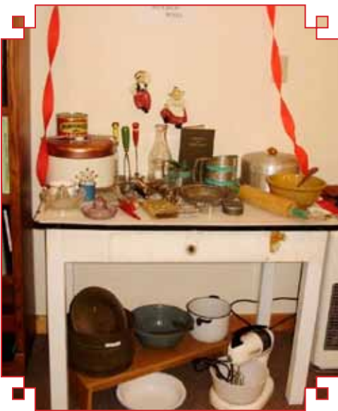
A display of 1950s kitchen equipment that was part of the August Open House, "Westville: 180 Years of Incorporation - 1829 to 2009"