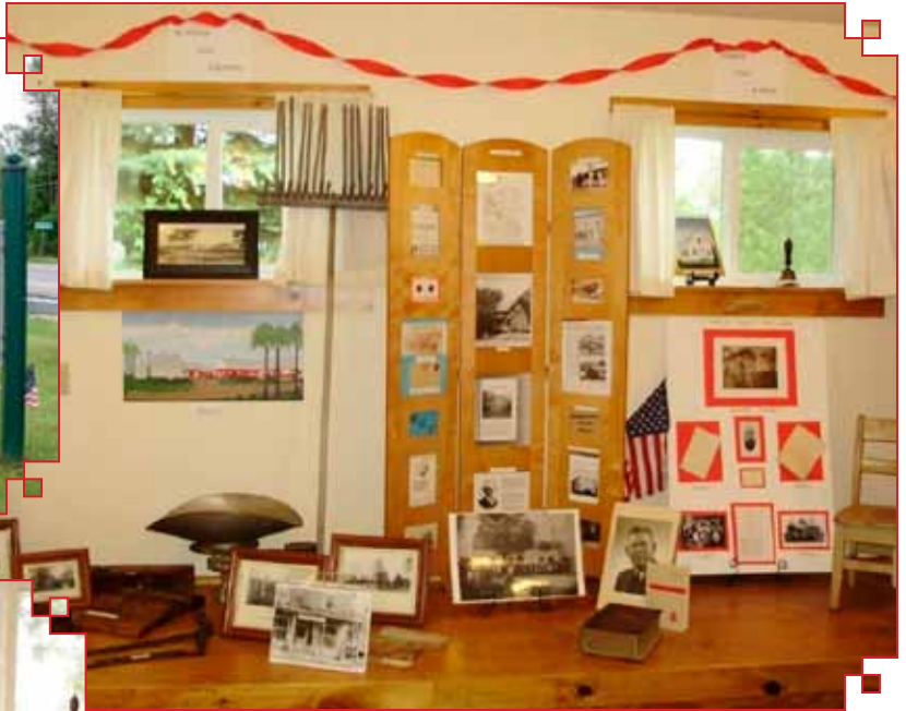
Displays at the Open House in August covered Business and Farming, Church and School, and Home and Family from 1829, when the town incorporated, to 2009. Below are displays of pictures and implements.