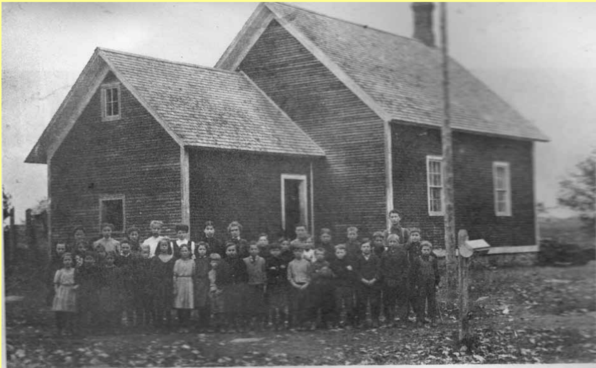
District No. 7 Schoolhouse — Pilfershire

This picture is of the one-room schoolhouse in what was known as the Pilfershire District. That would be the eastern end of the Westville-Trout River Road. We believe the time to be about 1880-1900, but not sure. We'd love to know the names of any of the students, or any other information about the school.