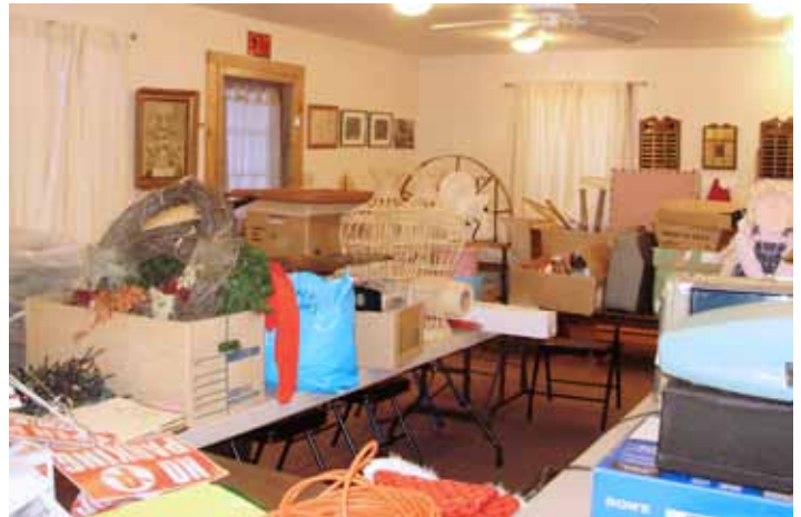
Attic items see the light of day.