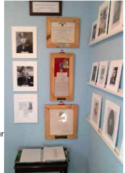
Killed in Action Memorial Wall with Purple Heart.

In the meantime, as your president, I appreciate the wonderful support received as we work to research, collect and preserve Westville’s history at the Westville History Center and Museum.